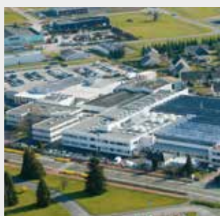
ARO headquarters, Château du Loir, France.

Based in Château-du-Loir near Le Mans in France, ARO has a worldwide presence, with branches and production sites in Europe, Asia and North, Central and South America delivering a complete range of services to international customers.